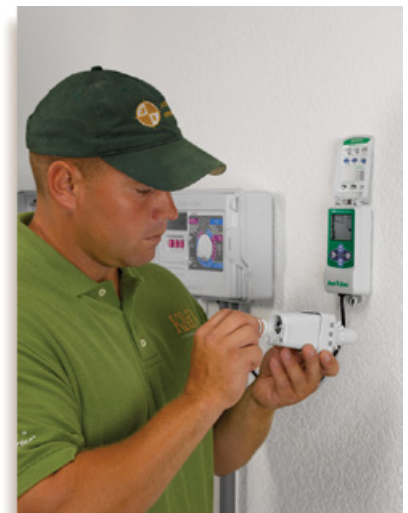
Battery replacement requires no tools or sensor disassembly