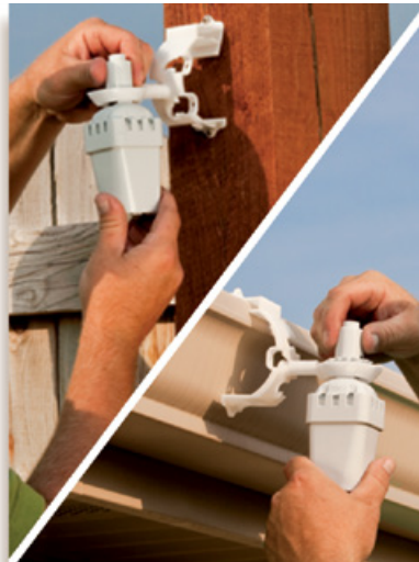
Sensor installs easily using versatile mounting bracket