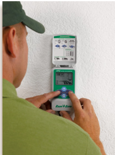
Programs in seconds