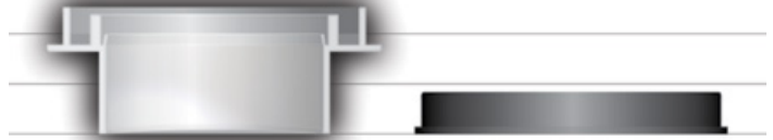
RAIN BIRD WIPER SEAL